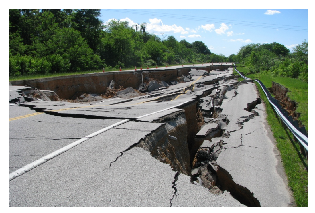
FIGURE 3 SR-7 in Maury County, Tennessee, after intense rainfall and record-level flooding in May 2010.

areas. Already, many states are experiencing more intense precipitation with record-level flooding—as occurred in Tennessee (Figure 3, above), Rhode Island, Iowa, and Wisconsin in 2010, and during Tropical Storm Irene in 2011 in Vermont. Alaska is responding to the thawing permafrost that affects transportation structures and roadways. State DOTs, MPOs, and local transportation agencies are working with climate scientists to better understand the risk and to incorporate climate change into transportation asset management planning. Climate change adaption confronts all transportation modes and all functions: planning, environmental review, design, construction, operations, and maintenance (24).