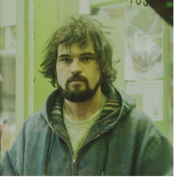
DEATH FROM ABOVE 1979