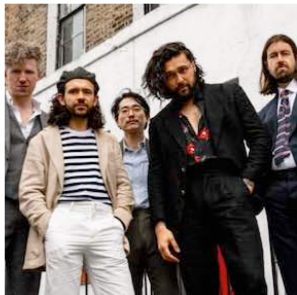
GANG OF YOUTHS